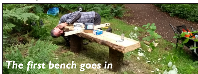
The first bench goes in